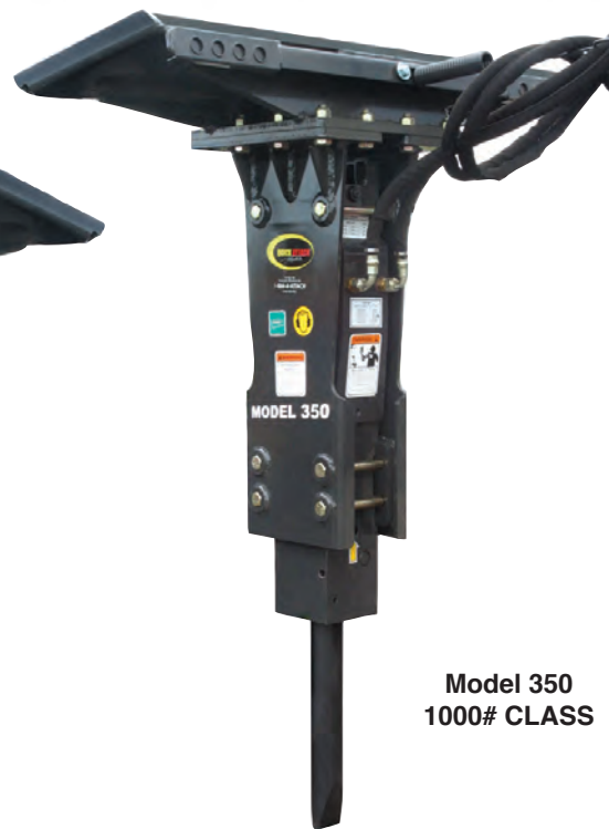
Model 350 1000# CLASS