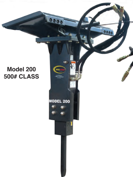
Model 200 500# CLASS