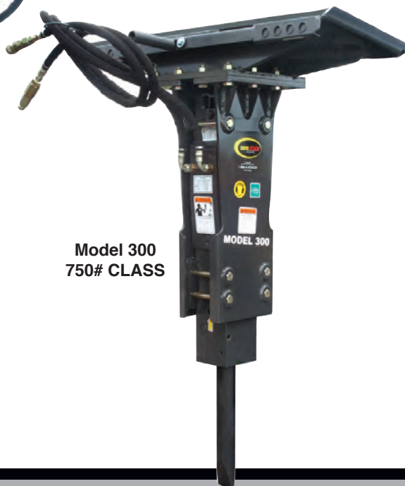
Model 300 750# CLASS