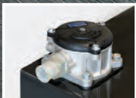
Oversized 10 micron in-tank filter protects system from contamination while maximizing performance.