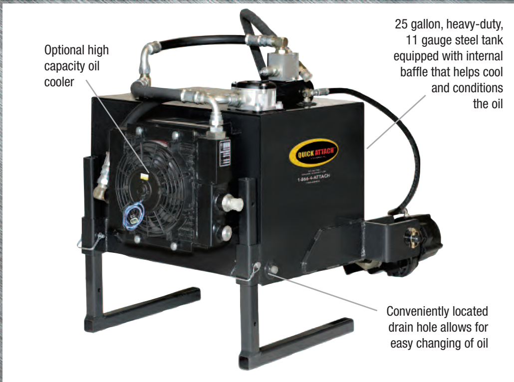
Optional high capacity oil cooler

Optional high capacity oil cooler with thermostatically controlled 12 volt fan maintains proper oil temperature with low pressure loss, extending the life of the components. Internal bypass valve protects the cooler from over pressurizing.