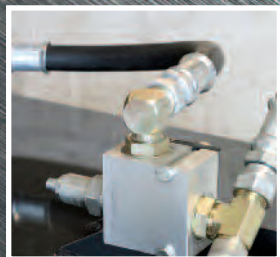
3,000 p.s.i. pressure relief valve protects system components from pressure spikes.