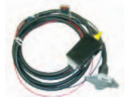
Toggle Control Harness is required if skid steer is NOT equipped with attachment control system.