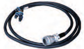
Wire harness for hydraulic models with attachment controls.